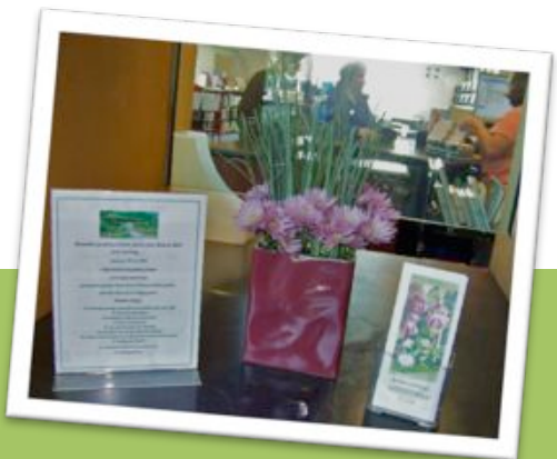
A beautiful library niche display by Jeanne Espinoza