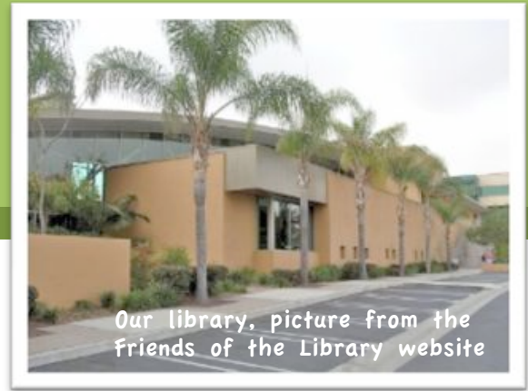
Our library, picture from the Friends of the Library website